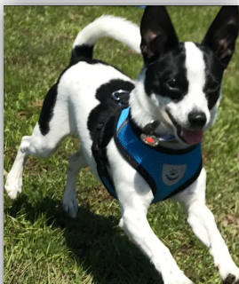
Pup of the week: Oreo