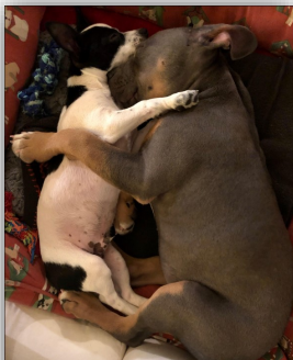
As pups in foster home