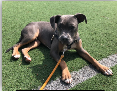
Pup of the week: Oakley