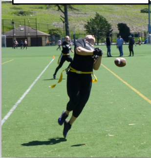
The Headless Receiver