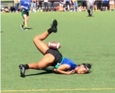
The Scorpion Butt Fumble

Save The Date: Friends & Family Day April 7, 2019