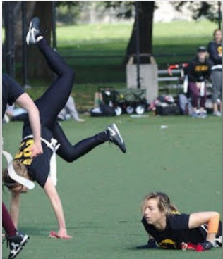
The Handstand Flag Pull